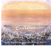
Echoes... Under the Sun CD