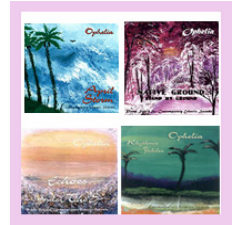
OHK CD/Fan Club Collection