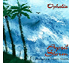
April Storm CD