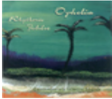
Rhythmic Jubilee CD