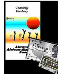
Always Eat African American Food